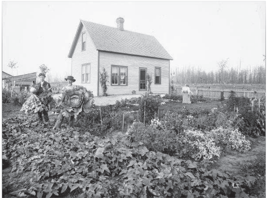
Results you can measure, as well as eat. Having dug up most of the lawn, as Mollison urges, these folks in Wisconsin in 1895 will have needed big weighing-scales and hearty appetites.

From long experience I can tell you what the results will be: the 'forest garden' will turn out to be a low-input/low-output system, while the standard horticultural plot will be a high-input/high-output system. You could say that both are equally 'productive' in labour terms, one suiting gardeners with more space than time, the other gardeners with more time than space. And you can easily imagine various mix'n matches in actual gardens. The permaculture movement has done us a service in